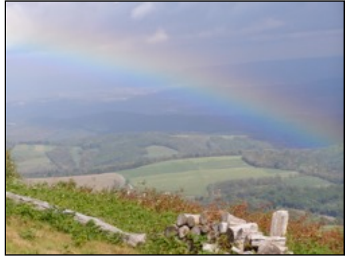
A Colorful Fall Day at the Allegheny Front

There is a pleasure in the pathless woods, There is a rapture on the lonely shore, There is society, where none intrudes, By the deep sea, and music in its roar: I love not man the less, but Nature more.