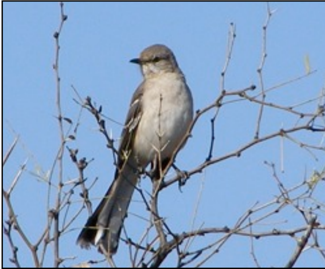
The Northern Mockingbird is the state bird of Arkansas, Florida, Mississippi, Tennessee, and Texas