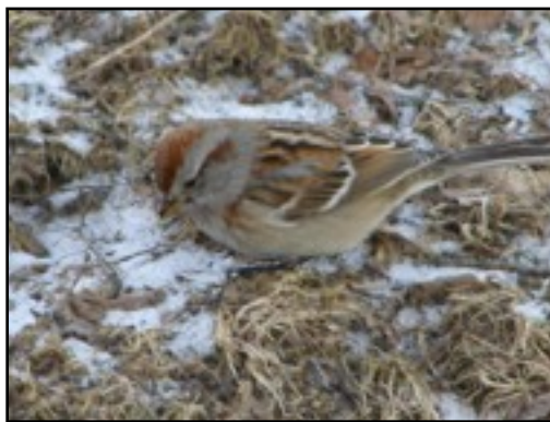
American Tree Sparrows lingered till mid-April

Wild Turkey are a common sight in the county, but it was very unusual to find a hen on a nest site in scrub and brush not even 10 feet off a rural dirt road near CV 5/11(MM,CW). The nest had 16 eggs in it, and was located under some wild honeysuckle bushes. On the following day all but one egg remained but the bird was not seen again and subsequent checks showed the nest site to be unsuccessful, likely due to high disturbance probable at this location. Common Loon is a species not uncommon to the county in migration, however this year 4 birds were found on the Clarion River outside of Clarion 4/17 (PM). This river is smaller and has poorer quality than the Allegheny and Kahle Lake where they are normally found. The last bird noted for the season was seen at Sarah Furnace 5/11 on the Allegheny River (CW). For raptor sightings, the best of the season was seen at CR