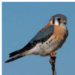
American Kestrel

The following includes excerpts from Greg Grove's article in Pennsylvania Birds, Vol. 19, No. 1, used with permission.