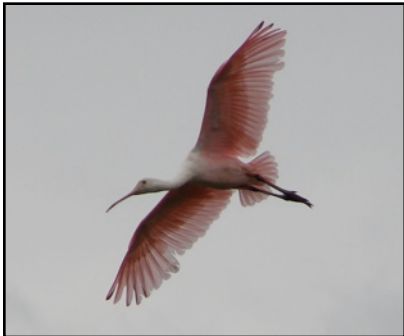
Roseate Spoonbill