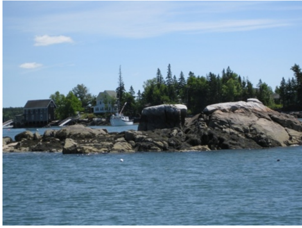
Audubon Camp in Maine