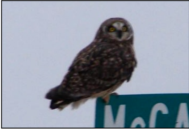
Short-eared Owl at Mt. Airy from this CBC.