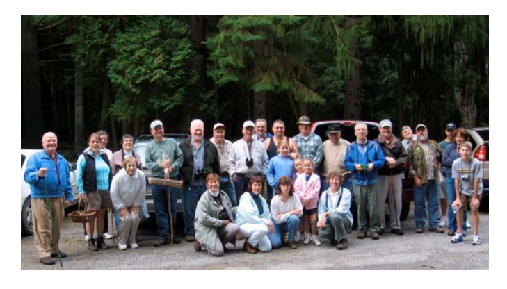
Mushrooms at Clear Creek 9/16/06

Welcome members and visitors to a great new Audubon year!