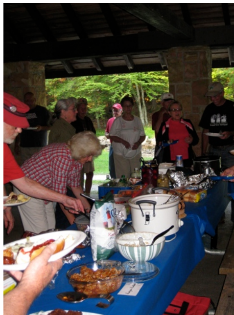
Hungry picnickers digging in