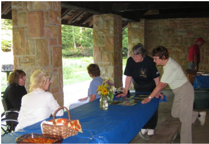
Picnic photos by Deb Freed - Members admiring Gil's photos