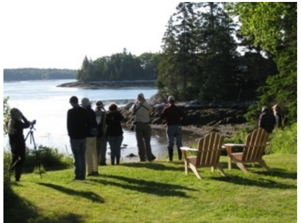
Hog Island